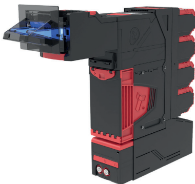
NV4000 with BNF & Replenishment Cassette